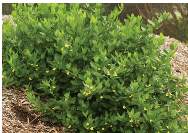
Hop goodenia Goodenia ovata