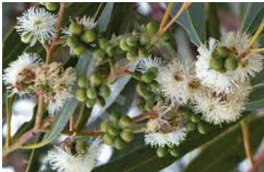
Bog gum Eucalyptus kitsoniana