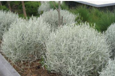
Cushion Bush Leucophyta brownii