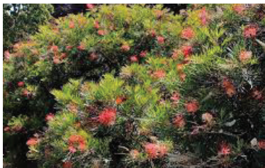
Spider flower Grevillea longifolia