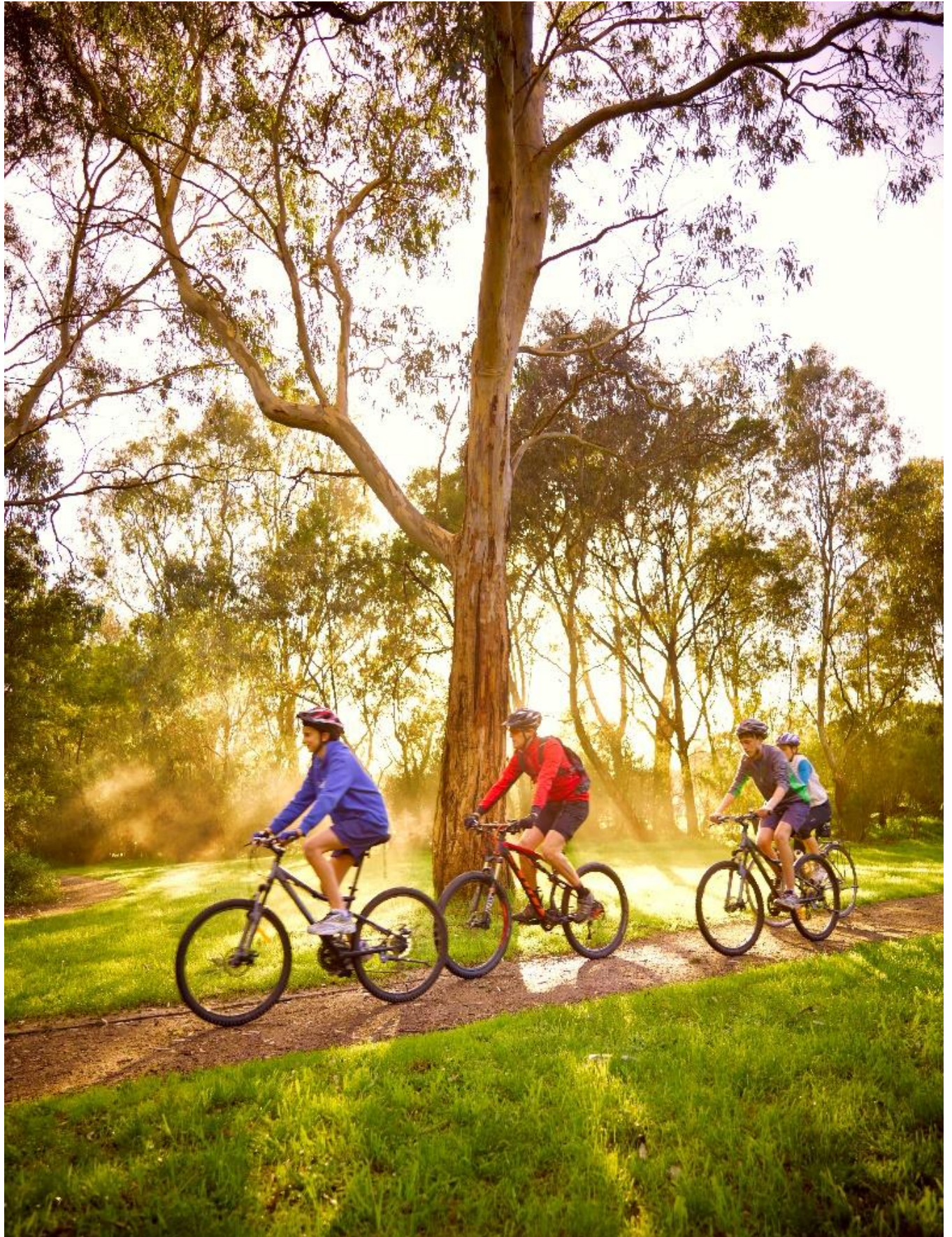
Image: Enjoying a ride along one of our many shared trails