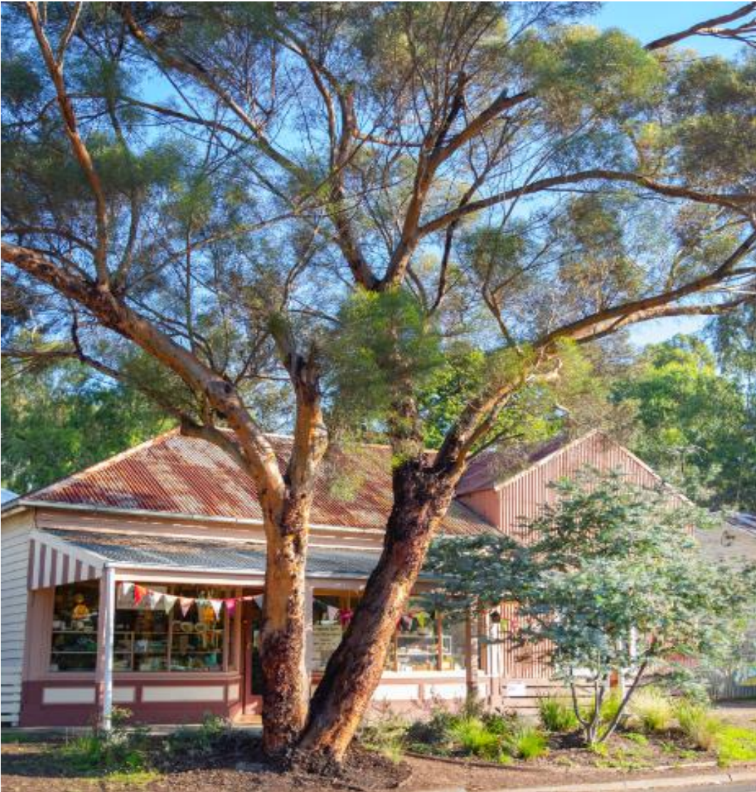
Image: Preserving the past for the benefit of the future