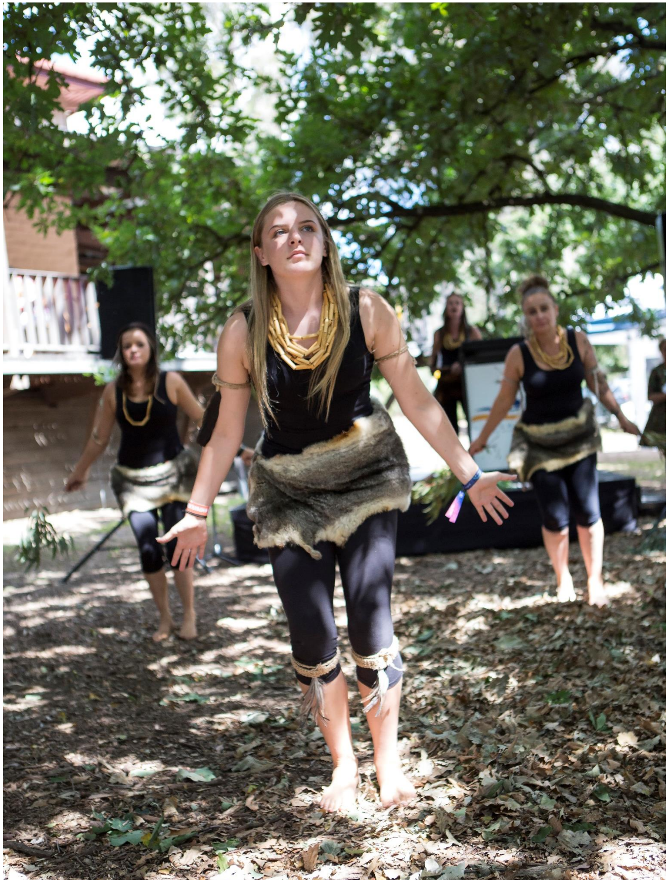
Image: Djirri Djirri Dance Group performing at a Council event