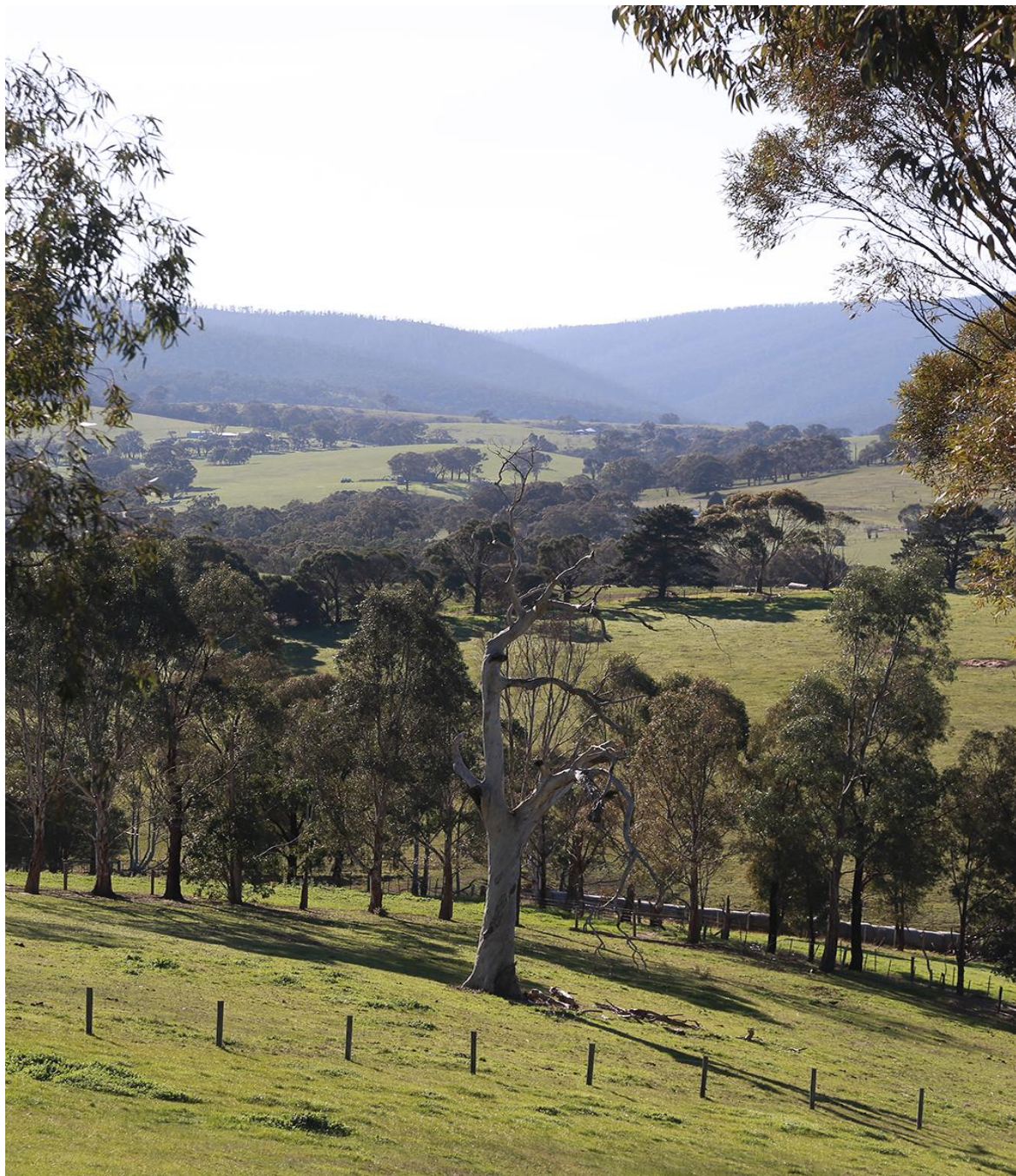
Image: A rural landscape in our Green Wedge

Each theme is a key focus area for Council and our community both now and into the future. The four themes contain a number of aspirations which were informed by the participant feedback received during the Our People, Our Place, Our Future engagement program. The direct quotes from participants included in this document illustrate context and sentiment to what was broadly received from this community engagement program.