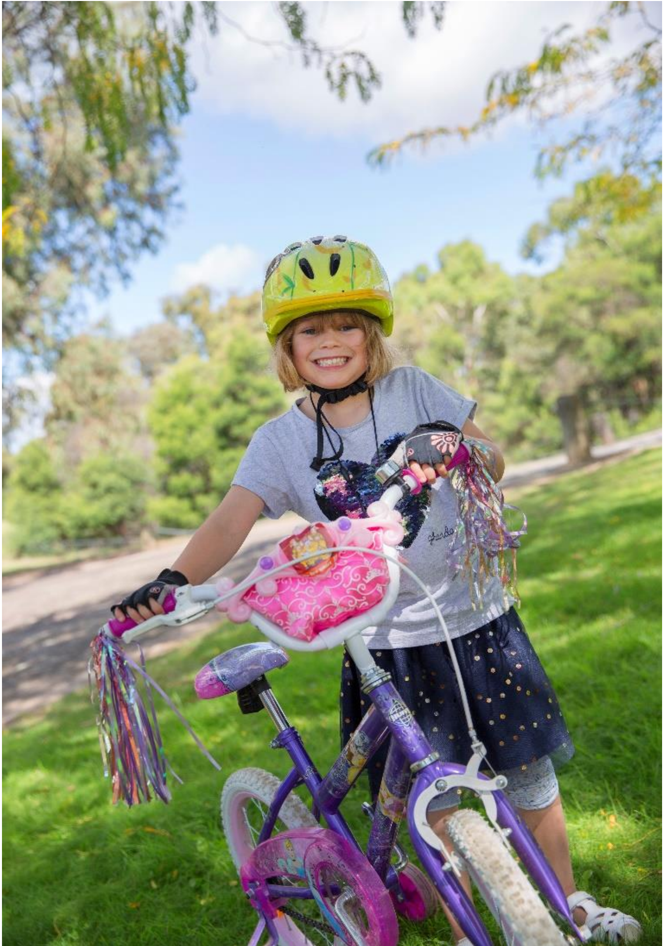
Image: Having fun in our vast open spaces