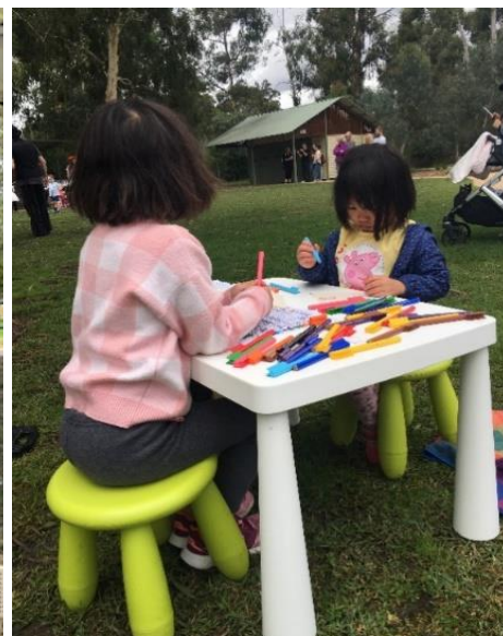
Images: One of 11 community 'pop ups' during the Our People, Our Place, Our Future engagement program