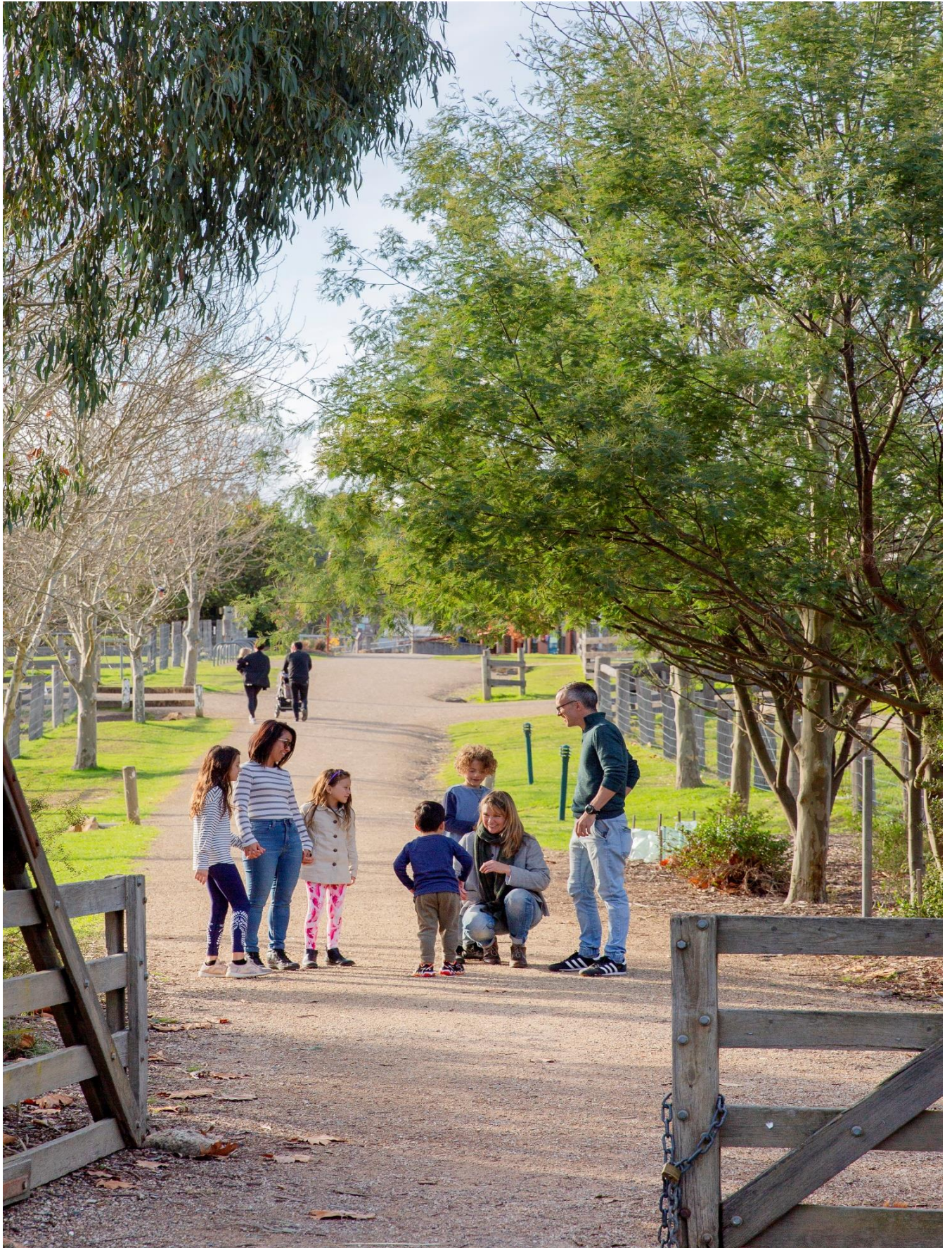
Image: Connecting at Edendale Community and Environment Farm