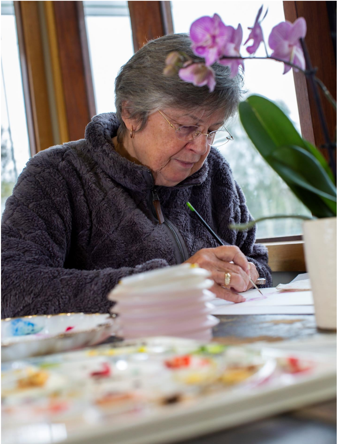
Image: Being creative in a local art class at Living and Learning Nillumbik