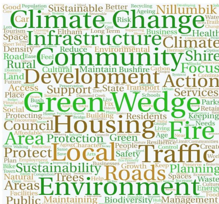
Image: Word cloud generated with responses from the Our People, Our Place, Our Future engagement program

This community vision document was developed following extensive community engagement through the Our People, Our Place, Our Future community engagement program that occurred in early 2021. Over 2,000 participants from our community engaged with Council through survey responses, community pop-ups, online and in-person workshops and written submissions. In developing this vision, we asked our community what they valued.