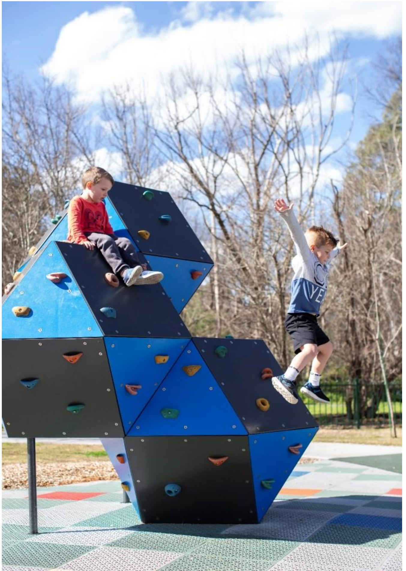
Image: Enjoying one of our many play spaces