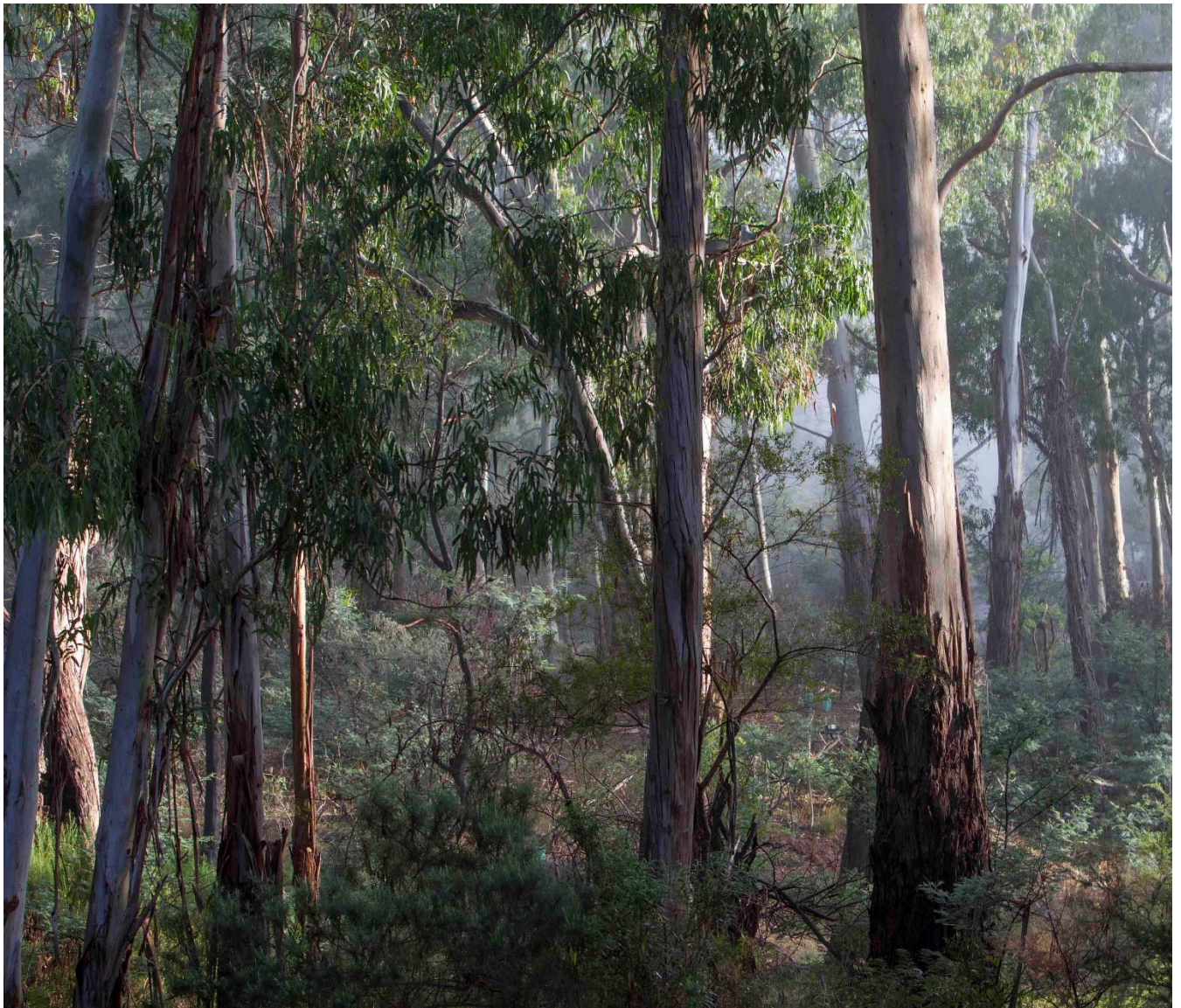
Image: Bushland near Cottles Bridge

We recognise and value the distinctive and special spiritual and material relationship that First Nations people have with the land and the water, including trees, rocks, hills and valleys, creeks, rivers and flood plains in our Shire.