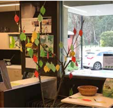
Above: Open Space Idea Tree