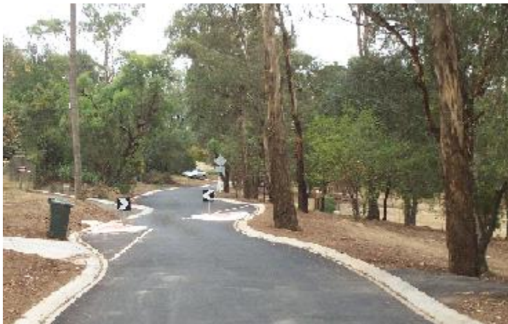
URBAN RESIDENTIAL ROAD CONSTRUCTION

This 'urban residential' standard of road design is recommended where property sizes are less than 0.4 of a hectare, on the basis that properties of this size are generally not able to absorb sufficient stormwater within the property.