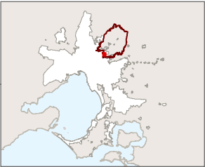
Part of Planning Scheme Map 13

Disclaimer This publication may be of assistance to you but the State of Victoria and its employees do not guarantee that the publication is without flaw of any kind or is wholly appropriate for your particular purposes and therefore disclaims all liability for any error, loss or other consequence which may arise from you relying on any information in this publication. © The State of Victoria Department of Environment, Land, Water and Planning 2018