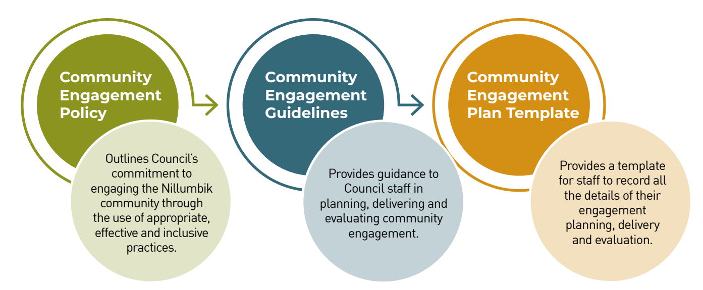
Figure 2: Integrated community engagement

We have several legislative requirements to engage. Council is committed to being respectful of the community's time in our engagement activities. We will coordinate and integrate our large scale community engagement where possible in the interests of efficiency.